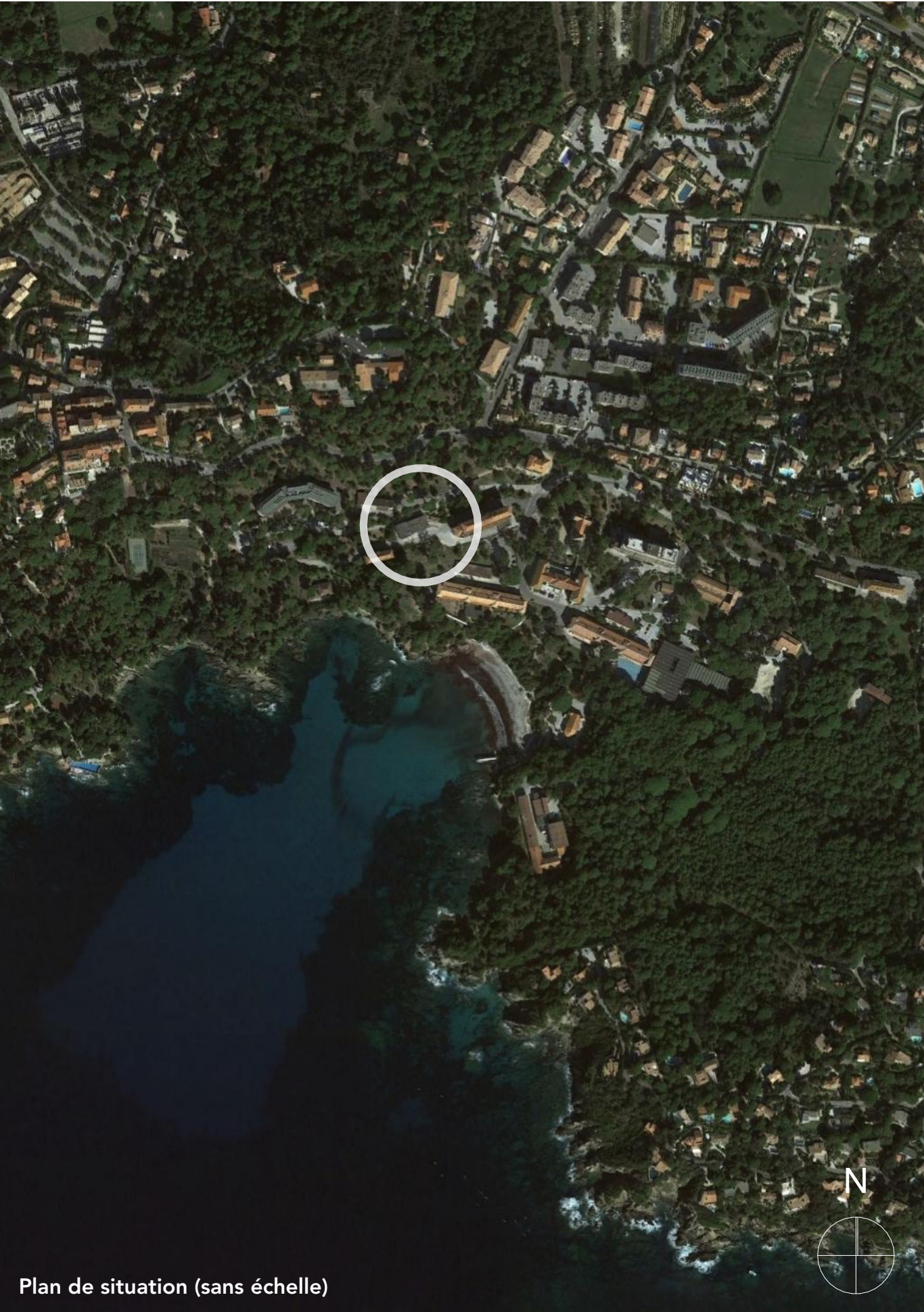
Plan de situation (sans échelle)